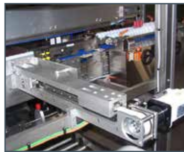
Servo Main Ram